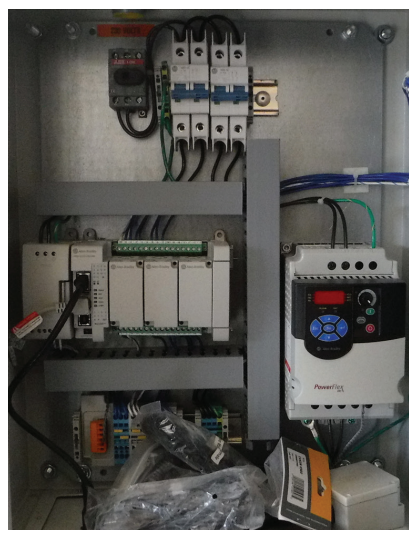
MC3 CONTROL BOX