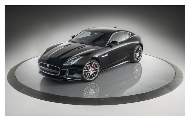
SHOOT AND PROCESS 30 OR MORE CARS DAILY WITH THE MC3 SYSTEM