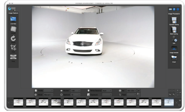
ICONASYS SHUTTERSTREAM SOFTWARE