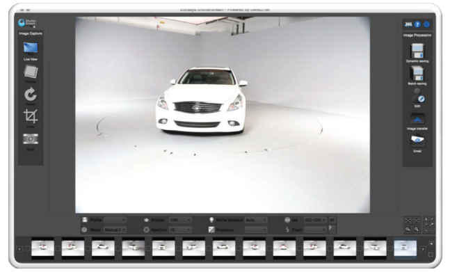
ICONASYS SHUTTERSTREAM SOFTWARE