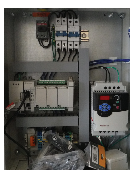
MC3 CONTROL BOX