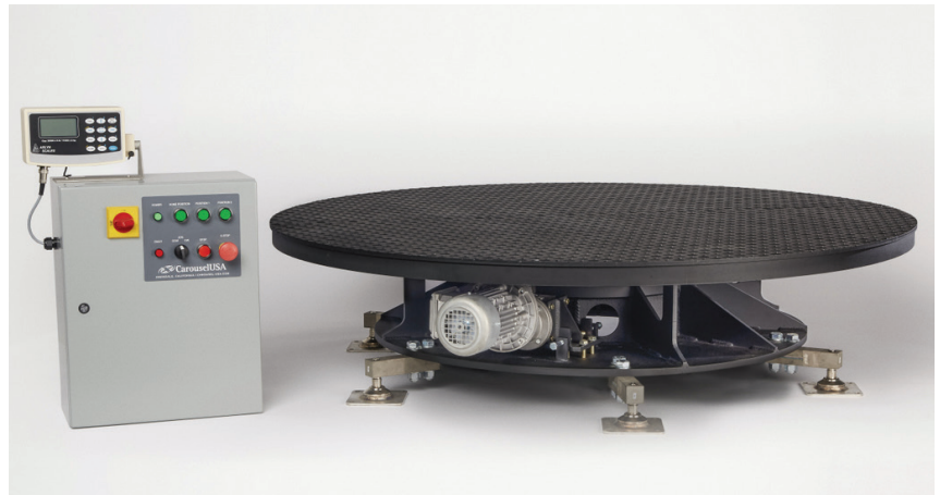
HEAVY DUTY WEIGHING TURNTABLE - 5' DIAMETER