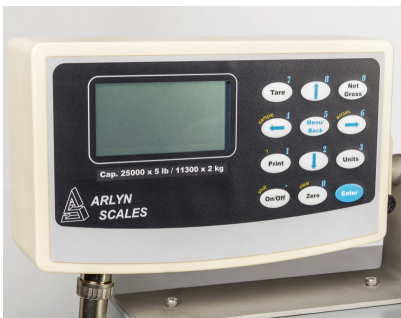
24,000 LB SCALE CAPACITY