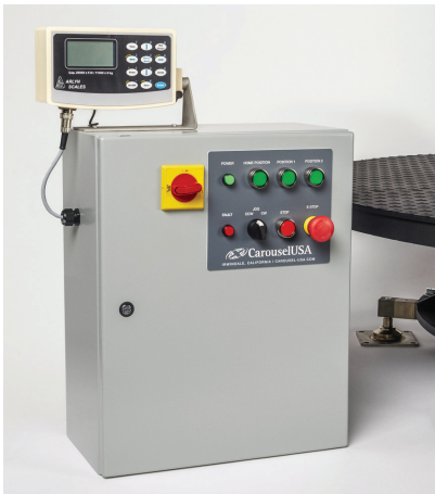
CONTROL PANEL WITH SCALE CONTROLS