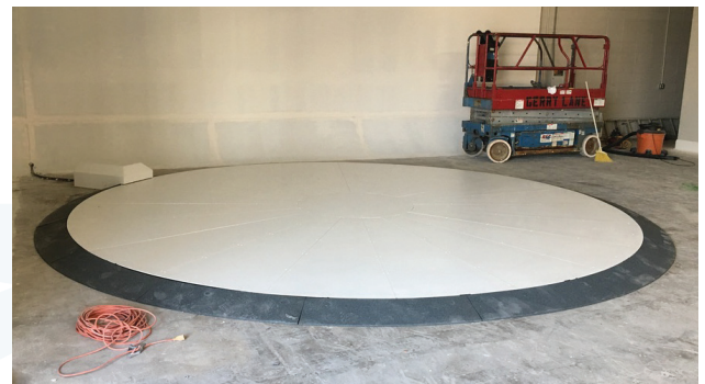
TURNTABLE WITH WHITE FINISH, UPON COMPLETION OF INSTALLATION