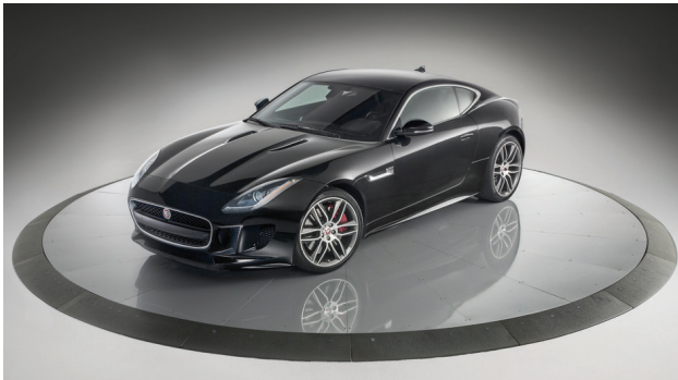
MAKE A MAJOR IMPACT WITH YOUR PHOTOS