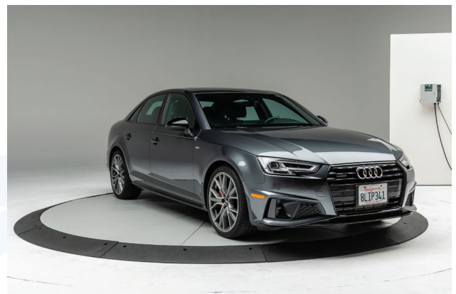
COMES POWDERCOATED IN FLINT GREY (T243-GR522).