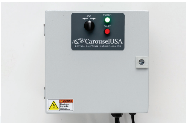
CONTROLS COME WITH 25FT CORD FROM CONTROL BOX TO DRIVE SYSTEM, AND 10 FT FROM 110V OUTLET TO CONTROL BOX. TURNTABLE CAN BE OPERATED USING CONTROLS LOCATED ON THE CONTROL BOX FACE, WIRELESS REMOTE, OR USING A SMARTPHONE APPLICATION.