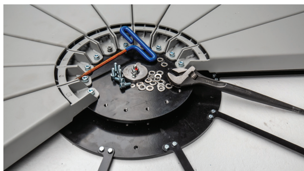
QUALITY MATERIALS AND USING QUALITY COMPONENTS.