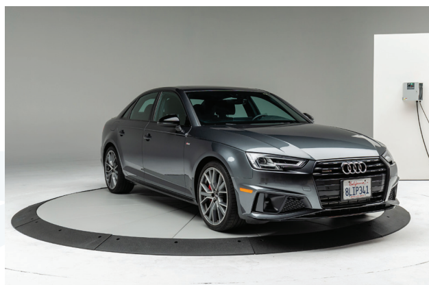
COMES POWDERCOATED IN FLINT GREY (T243-GR522).